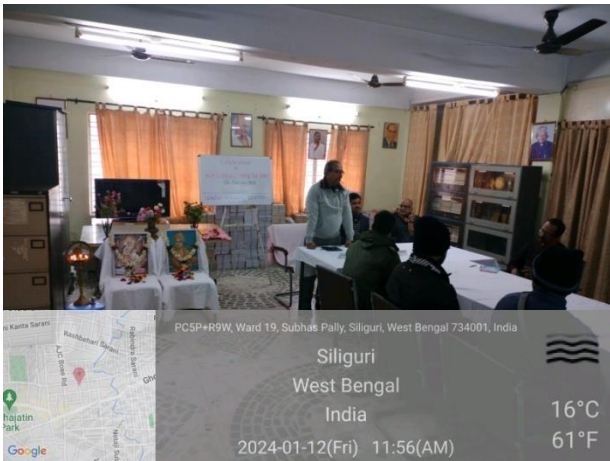
Motivational speech by the Chief Guest