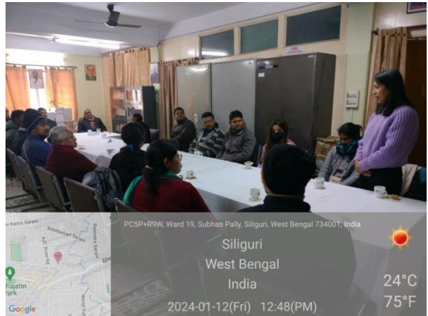
Speech by students