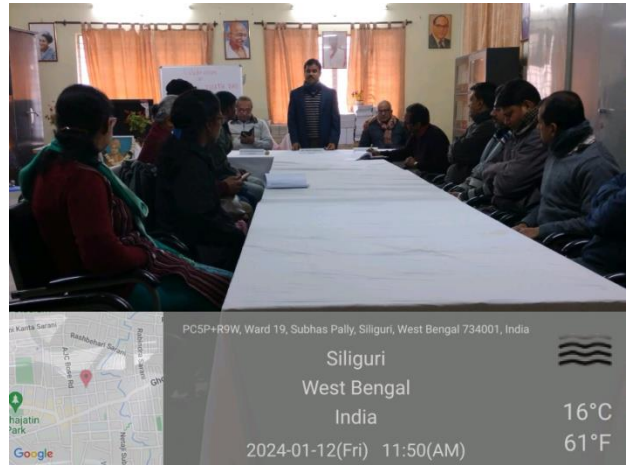
Speech by the Regional Director